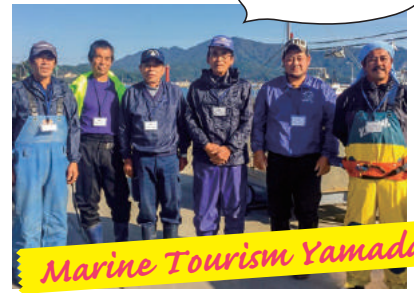
Marine Tourism Yamada

At your service! We are the Team Fisherman Supremos